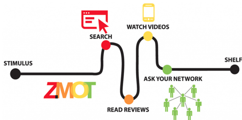
Figure 1. "The Zero Moment of Truth" - Google

Chen and Xie (2004) observe customer online reviews as a new element of marketing communication mix that has a growing importance in contemporary communication. Other authors observe social media as a "hybrid element of promotion mix" due to the fact that they provide companies with the opportunity to conduct direct and interactive communication with customers, while allowing customers to establish mutual communication and share information with each other (Mangold, Faulds, 2009). Furthermore, organizations have realized that conducting advertising activities on social media is far more cost effective as it allows expanded message reach, which is disseminated as a consequence of user activities rather than buying expensive traditional media space.