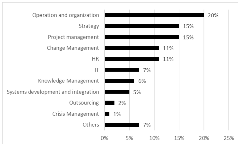
Figure 3. Most common business consulting activities in Hungary in 2015

A similar survey was done in 2015. In this survey 130 companies answered the questions. Hungarian companies could give up to three answers to the most common consulting activities used. Unfortunately the report of the research only gives relative numbers to each other which is not directly comparable to the 2014 numbers. In this survey the most used consulting services in Hungary are operations (20%), strategy (15%) and project management (15%). The order is similar to the survey of 2014 (Poór 2015).