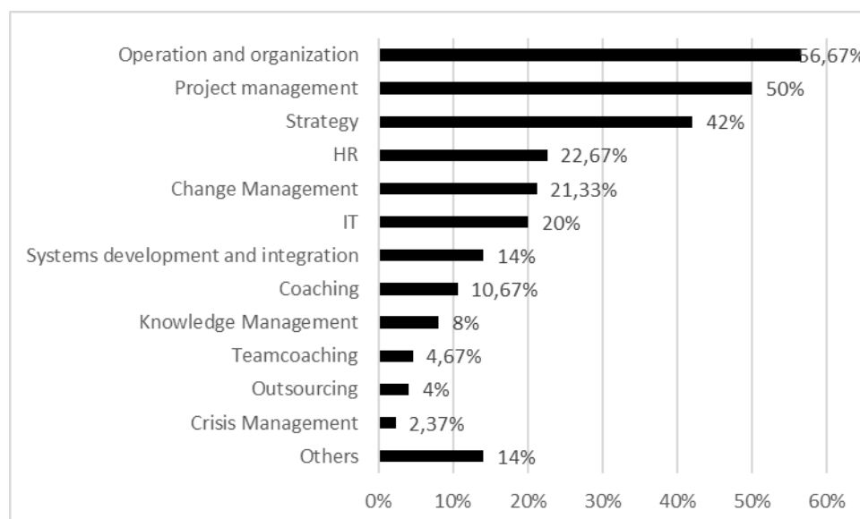
Figure 2. Most common business consulting activities in Hungary in 2014

The above mentioned survey shows that the most common activity in Hungary after the financial crisis was to start new activities and the second most common activity was to redefine the strategy of the company (Poór 2014). The companies were asked about which consultancy field is increasing or decreasing by their opinions. Use of the consulting services show that strategic and HR consulting activity declined the most. This can mean that the market of these consulting services became saturated.